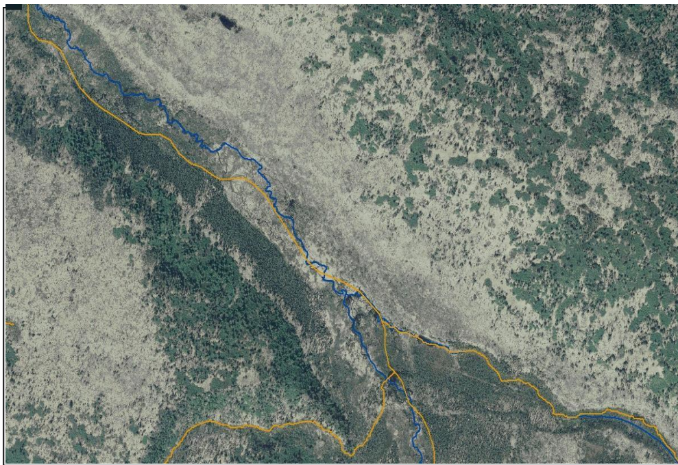
Figure 3. Feature realignment, orange is misaligned and blue is corrected

High resolution aerial imagery is preferred for delineation of features. Due to acquisition costs and availability, these images were only available for limited portions of the project study area. Where available the aerial imagery aided greatly in visually identifying: feature misalignment ( Figure 3 ); locations where new 1D and 2D features should be added; and, where the extents of 1D and 2D features needed to be revised ( Figure 4 ).