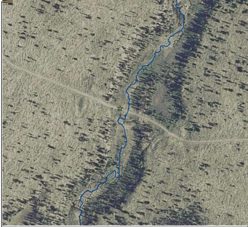
Figure 5. Star validates a culvert is present for allowing flow across road

As part of the update process, GSS interpreters attempted to classify streams as perennial, intermittent, or canal. All delineated channels were initially assigned a perennial classification unless strong evidence indicated that the channel was dry on the imagery or if the feature existed on steep slopes above the tree line. The assignment of stream classification was based on a several factors including: frequency and duration of water in the channel; location on steep slopes; and, presence or absence of vegetation. GSS interpreters used all available data, collateral datasets plus other ancillary information to drive the decision process regarding stream classification.