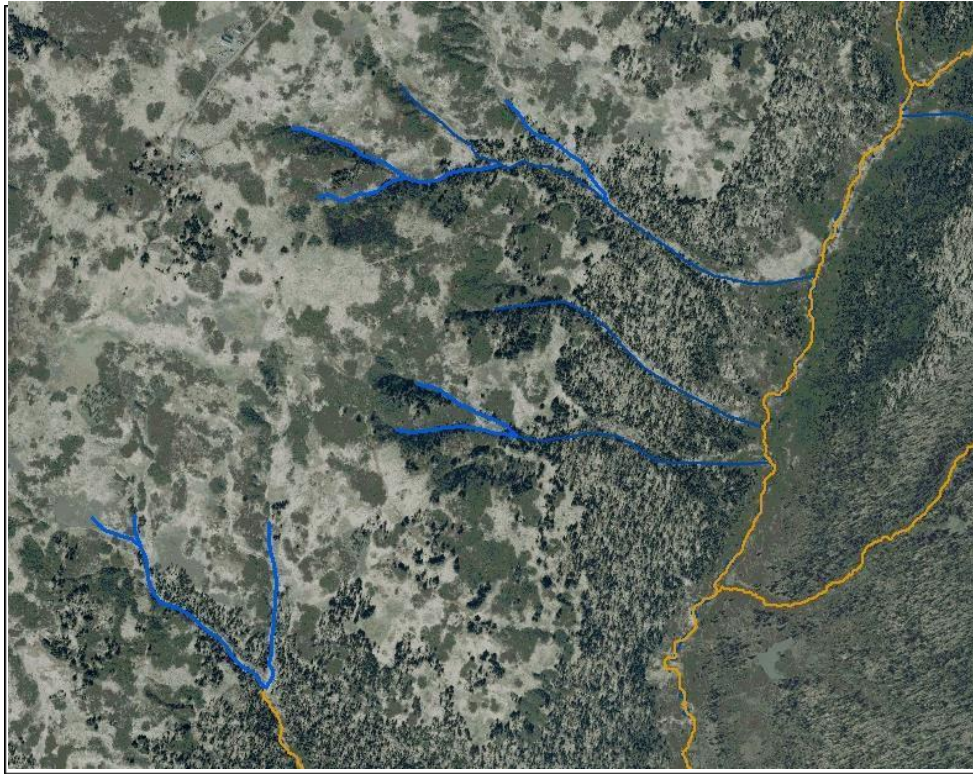
Figure 4. Blue 1D features are additions (densification) to the flowline network

SPOT5 imagery data was readily available through the SDMI web mapping service as color infra-red (CIR), panchromatic and true color layers. The processes employed to create the statewide SPOT5 mosaic tends to washout or blend the colors causing the imagery to be not as vibrant in contrast. As this data was delivered as a web mapping service, the ability for GSS interpreters to manipulate the spectral band histograms was not available. This caused a limitation to the possibility of creating contrast for better identification of features, however, it did provide consistency in the imagery for every interpreter.