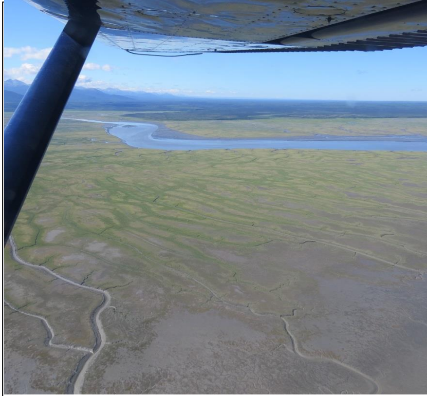
Photo 1. Mud flats, tidal guts, estuarine vegetation – Chickaloon Bay

Much of the field work planning can and should be done in the office, however good field work will evolve while the crew is in the field and new questions arise. On-site observations of natural occurrences drive and develop the interpreters understanding of the interconnectedness and processes affecting the local hydrology. Additionally, it can be expected that once the field work findings are incorporated into the editing process, changes in understanding of the natural landscape and hydrologic function will result in revisions to previous editing and data capture decisions. In some cases, field check site points are included that are not readily accessible. These points are instrumental in observations of visual evidence of flow where vegetation obscures a potential stream bed on the imagery. Other examples of inaccessible field check points include large features like a coastal bay or field check points located in valleys visible from the road side, but not accessible by vehicle or on foot. Aerial observations also contribute to the understating of what is occurring hydrologically (Appendix B).