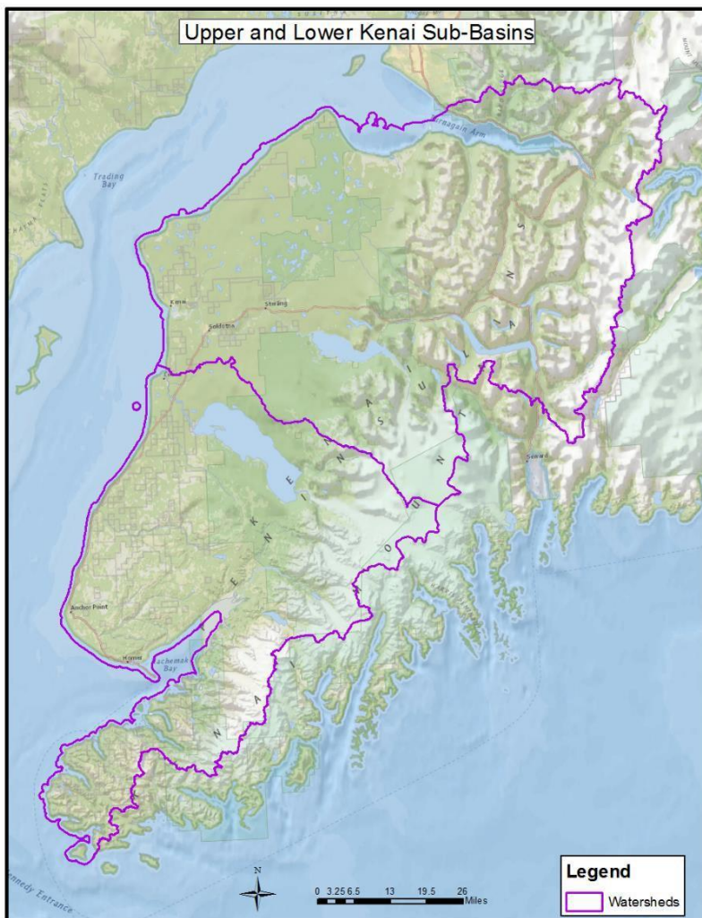
Figure 1. Kenai Peninsula – Upper and Lower Kenai Sub-Basins

The Kenai Watershed Forum (KWF) tasked Saint Mary’s University of Minnesota GeoSpatial Services (GSS) with the completion of a comprehensive review and validation of both the one dimensional (1D or linear features) and two dimensional (2D or polygon features) NHD data for two hydrologic unit code (HUC) sub-basins (HUC-8 19020301 and HUC-8 19020302) on the Kenai Peninsula, Alaska (Figure 1). The NHD for a portion of these sub-basins were updated in 2012 using flowlines derived from a LiDAR based digital elevation model (DEM). The LiDAR data did not completely cover both HUC-8’s and the resultant data outside the LiDAR coverage consisted of NHD that had not been created to the standards developed by the multi-agency Alaska Hydrography Technical Working Group (AHTWG).